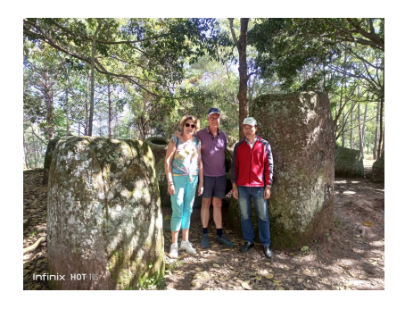
Day 5 : Discover the Enigmatic Plain of Jars